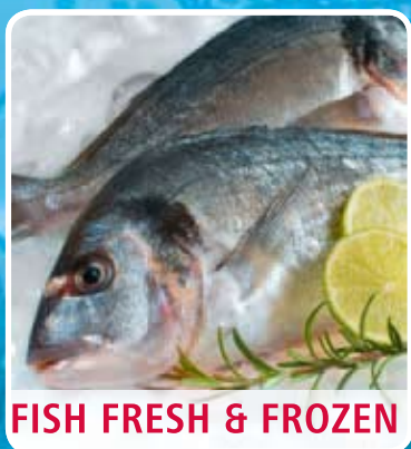
FISH FRESH & FROZEN